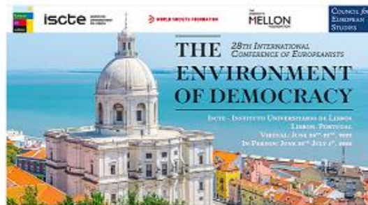
Twenty-Eighth International Conference of Europeanists

Please note that you can only submit two individual paper proposals and one roundtable/ book panelist proposal for the in-person conference component in Lisbon on June 29-July 1, 2022. Individuals applying for the online conference component are limited to one proposal only. Participation as chair or discussant does not count towards this limit.